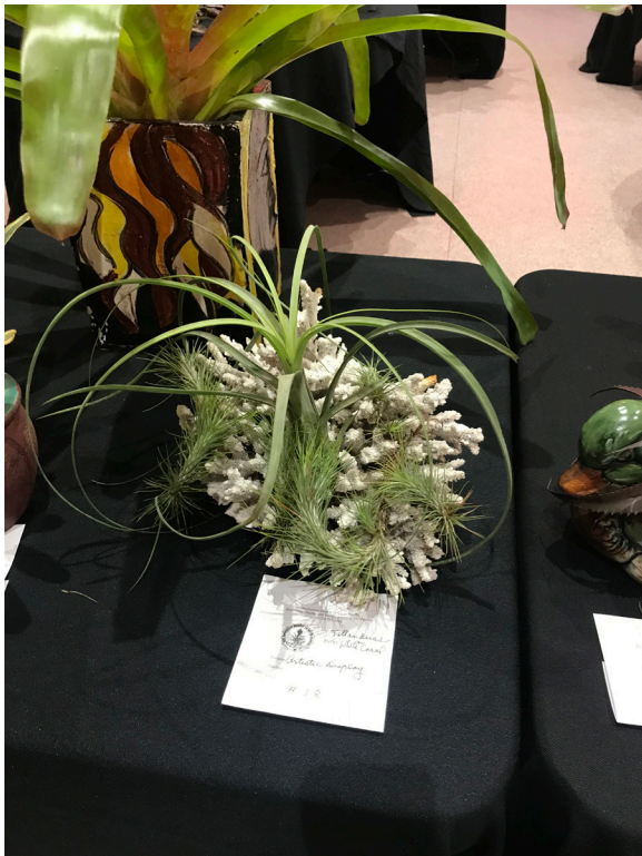
1st Place - Ofelia Sorzano