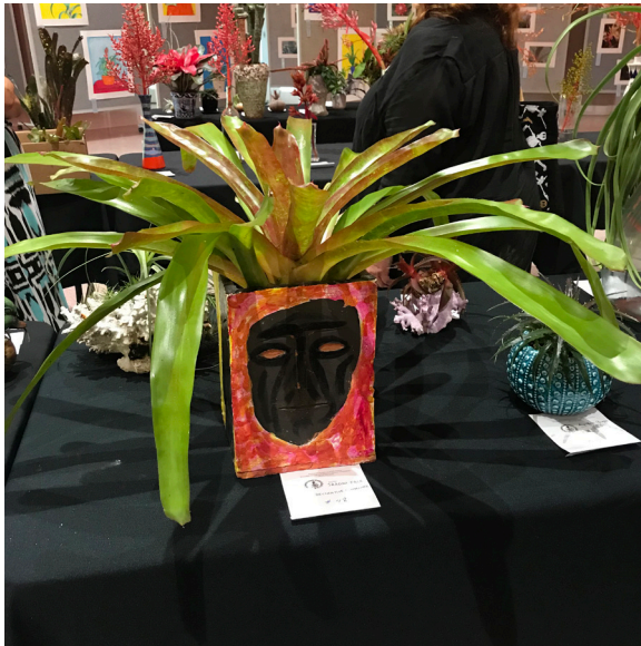
2nd Place - Decorative - Ofelia Sorzano