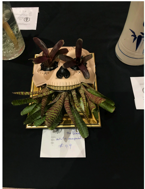
1st Place Decorative Ofelia Sorzano