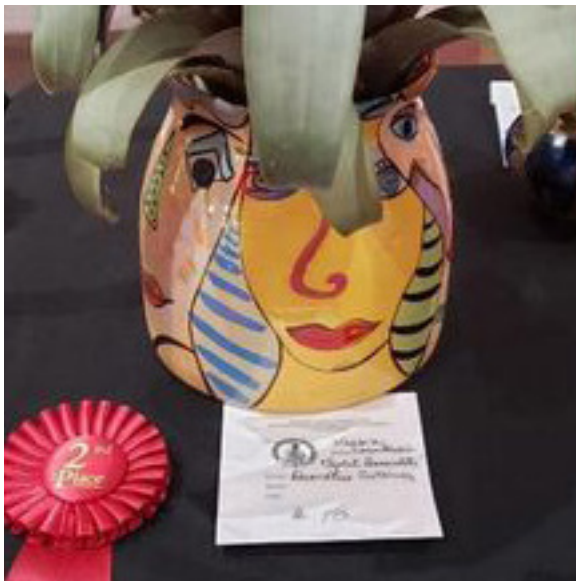
2nd Place - Decorative - Tina Severson