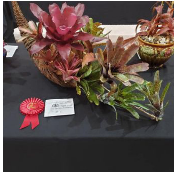
2nd Place - Tina Severson